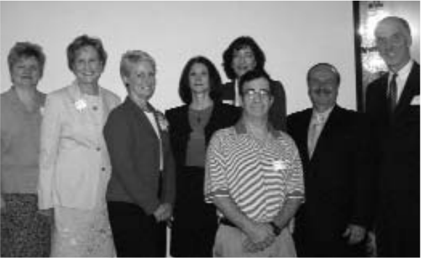
Pocono Health System -

Pocono Healthcare Management, a subsidiary of Pocono Health System, provides a management service to private physicians. Other Pocono Health System subsidiaries include Pocono Ambulatory Service, Pocono Medical Center, Pocono Healthcare Partners, and Pocono Health Foundation. Pocono Health System meets the community health needs and has partnerships with businesses, school systems, Pocono Healthy Communities Alliance, and several social service agencies. Mountain Healthcare Center located at 100 Community Drive in Tobyhanna provides comprehensive family healthcare and is open seven days a week.