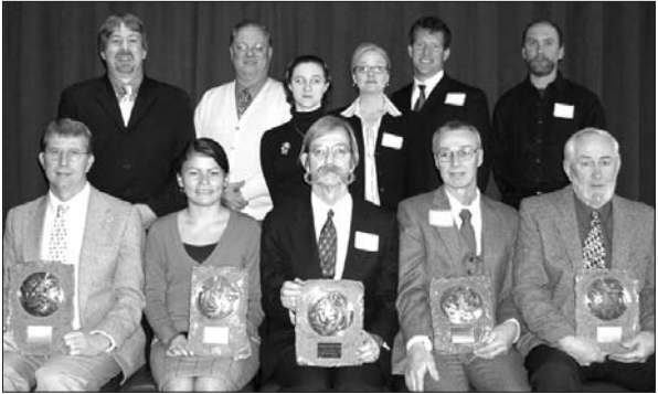
2004 Save Our Planet Award Winners