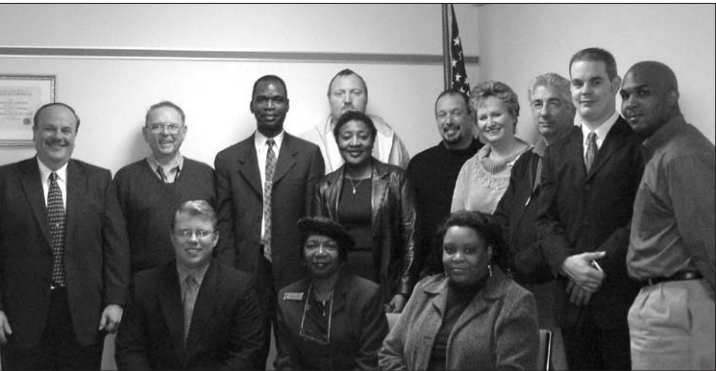
New members shown above