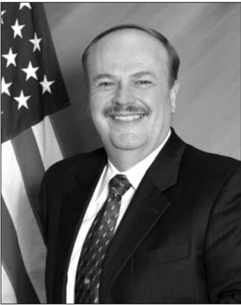
From the President

The Pocono Mountains Chamber of Commerce is proud to host EXPO 2005. ESSA Bank & Trust has graciously agreed again to be this year's major sponsor for the third year in a row. This year marks the 18th Anniversary that the Chamber has hosted the EXPO, which is recognized as the region's largest business and community exposition. EXPO 2005 will be held at East Stroudsburg University's Koehler Fieldhouse on March 9 and 10 from 3:00 p.m. - 8:30 p.m. EXPO provides an excellent opportunity for our members to showcase their products and services, as well as personally networking with potential clients in a controlled atmosphere.