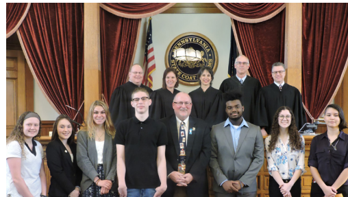
Cover Photo: Law Day award recipients. For full details, turn to page 8